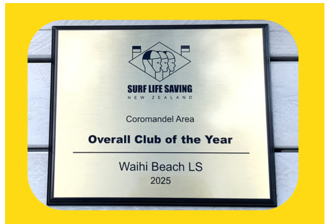
Waihi Beach Lifeguard Services lifeguards and volunteers at the Eastern Region Awards of Excellence 2025